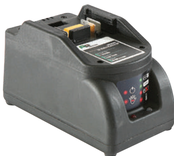
Convenient battery removal system.

Battery charger will ensure protection on thresholds for temperature and internal pressure of the charging batteries to improve quality and increase battery life.